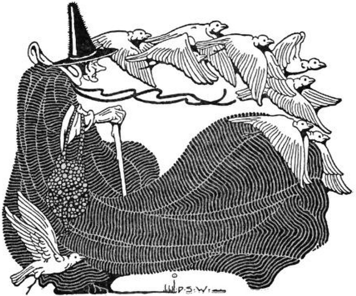
Witch with Birds