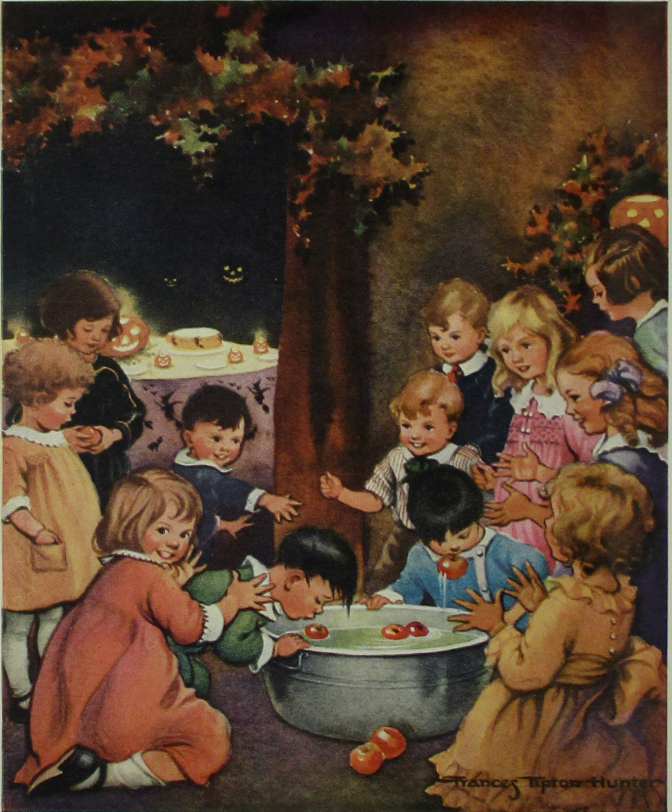
Our Hallo'we'en Party