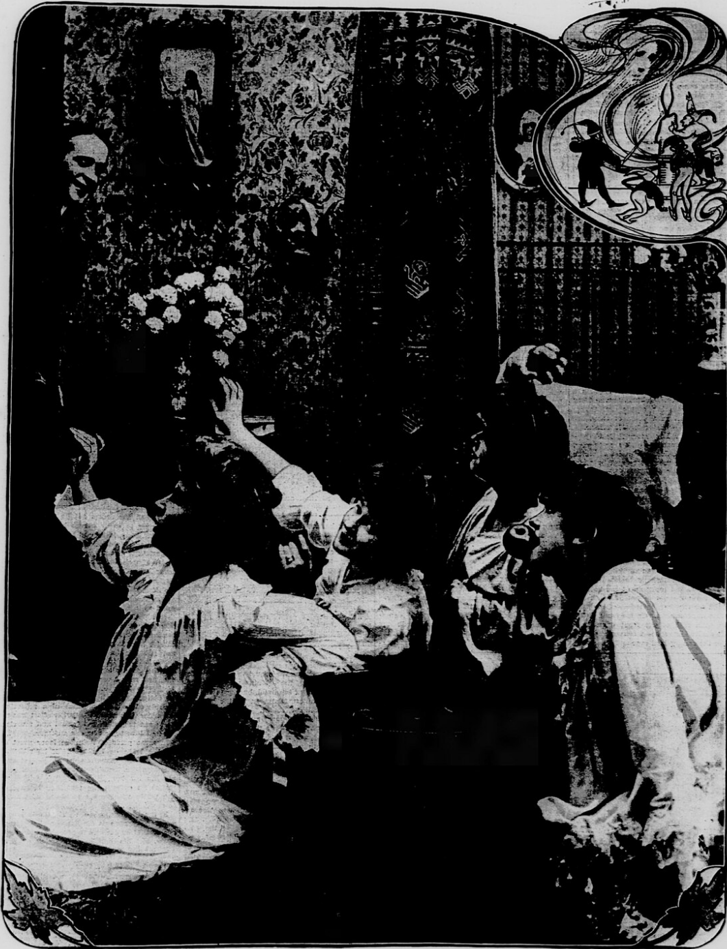
The Halloween Party: Bobbing for Apples

THE HALLOWEEN PARTY. BOBBING FOR APPLES—"CAN'T I GET IN THE GAME?"